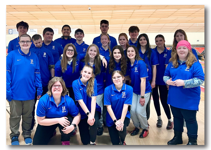
The district had two Unified Bowling teams who competed during the winter season.

Visit www.horseheadsdistrict.com/HCSDBudget2024-25.cfm for more information.