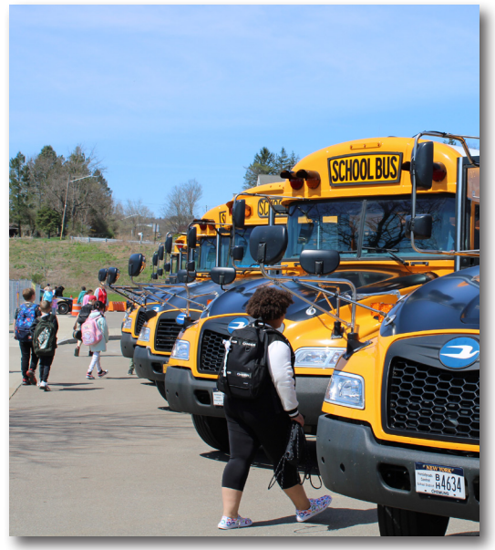
Currently, the district has 74 buses and six other student transportation vehicles.

Maintaining a replacement schedule allows the district to keep its bus fleet in good working order, minimizing maintenance needs. The district's Transportation Department has a current bus inspection passing rate of 98.7% as a result of the regular care they take in maintaining buses while minimizing costs.