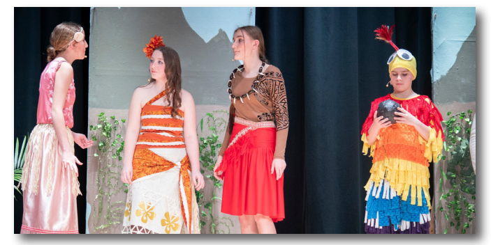
Middle School students preformed Disney's "Moana JR." in March as their spring musical.

The proposed budget includes $2$ million in debt service funds, $1$ million of fund balance, $700,000 from appropriated reserves, and $170,000 interfund transfers. Other revenue of $2.6 million includes Medicaid and Medicare reimbursements, BOCES refund, interest, admissions, rental income, and donations and gifts.